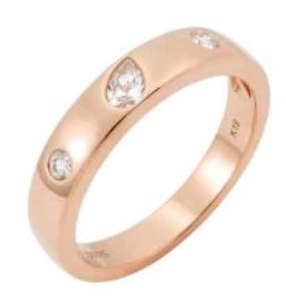
General Conditions Apply Visit: www.damiancolombo.com

Ring in 18k rose gold set with 1 pear-cut diamond and 2 brilliant-cut diamonds. Weight: 3.96 gm.