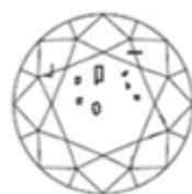
I1 / I2 / I3 Included