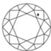
VVS1 / VVS2 Very Very Slightly Included