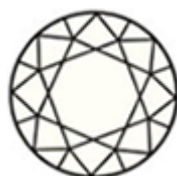
G-J Near Colorless