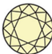
N-R Very light